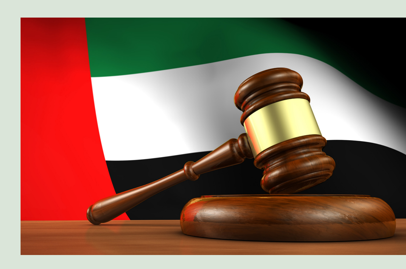
Certificate in UAE Law